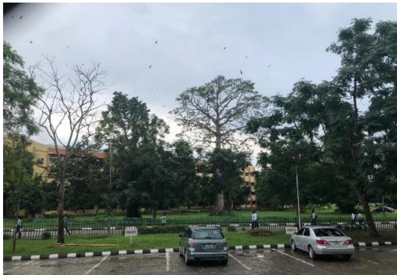
Bats and some their habitant on Covenant University Campus

institution also collaborates with local communities to maintain shared land ecosystems, contributing to broader biodiversity conservation goals.