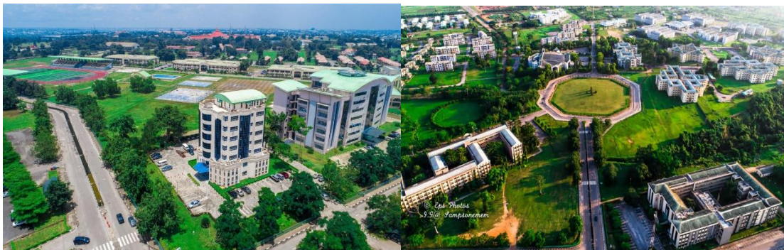
Covenant University Landscape (cross-section)

Covenant University also promotes sustainable agricultural practices through its 1,000-hectare farm. This initiative supports food and cash crop cultivation (e.g., cassava, plantain, vegetables) and aligns with its commitment to sustainable campus farming, implemented in 2015.