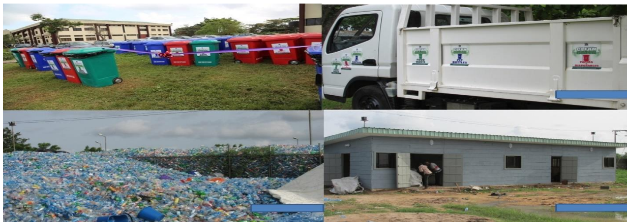
Covenant University "Waste to Wealth" initiative, created in 2017 and still ongoing.

The university has implemented several waste disposal policies to reduce environmental impact. A 2017 policy supports plastic recycling through partnerships with organizations like Alkem Nigeria. In line with national water quality standards, Covenant University ensures safe water discharge practices. Additionally, the university's "Waste to Wealth" initiative, created in 2017 and reviewed in 2019, includes waste disposal processes that handle hazardous materials responsibly, further showcasing its commitment to sustainable waste management.